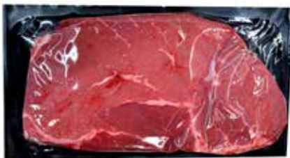
Top Round Steak