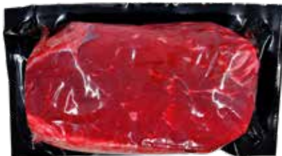
Bottom Round Steak