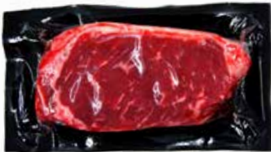
NY Strip Steak