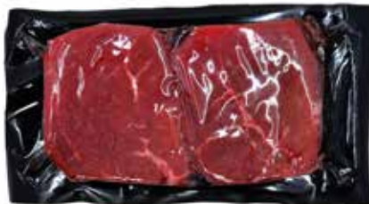
Beef Eye of Round Steak