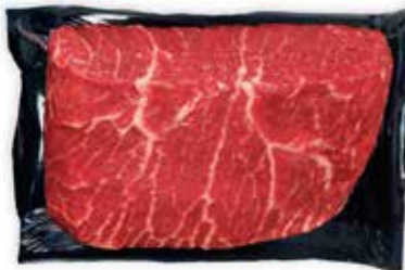
Flat Iron Steak